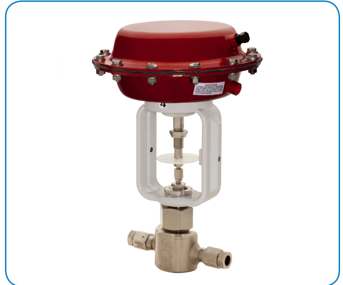
Type 1711HD Valve